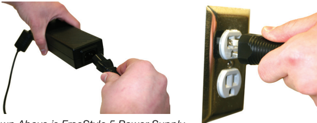
Shown Above is FreeStyle 5 Power Supply

Connect one end of the AC power cord to the inlet on the power supply brick. Connect the other end to a wall outlet.